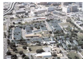
(top left) St. James Episcopal Church, present day; (top right and middle) Rendering of proposed Central Park redevelopment including St. James; (bottom) Aerial of Central Park looking South, present day.