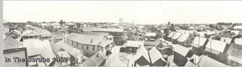
In The Scrubs 1932

Central Park Village opened in the 1950s with 482 units. It was built in an area of Tampa known as "The Scrubs". The Scrubs was a predominantly African American community, settled by former slaves shortly after the Civil War. By the early 1950s the neighborhood was run down and mostly comprised of tin-roof shacks, apartment houses and cottages. Many houses still lacked modern amenities like plumbing and electricity. I-4 and I-275 were built and completed during the 1960s. These projects erased any remaining traces of the original "Scrubs" community. The past 50 years have taken their toll on Central Park and the community is now slated for demolition. A new mixed-income / mixed-use development is to be built in its place. The layout of the new development will help to link the surrounding neighborhoods and Central Park with one another. There are a few historic sites still remaining within and around Central Park; Meacham Alternative School, St. James Episcopal Church, St. Peter Claver Catholic School and the Allen Temple AME Church, now known as the Paradise Missionary Baptist Church.