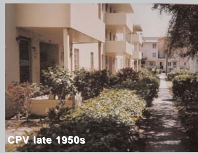
CPV late 1950s